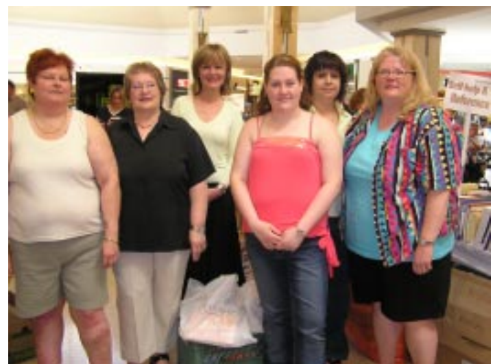
Staff and volunteers at the LiteracyWorks book sale

Vigorous volunteers and stalwart staff manned a stall at Kildonan Place to sell more than 2,200 books at LiteracyWorks Annual Booksale. Many books remain, which LiteracyWorks is willing to pass on to interested takers. Contact them at 786-1212 or litworks@shawbiz.ca .