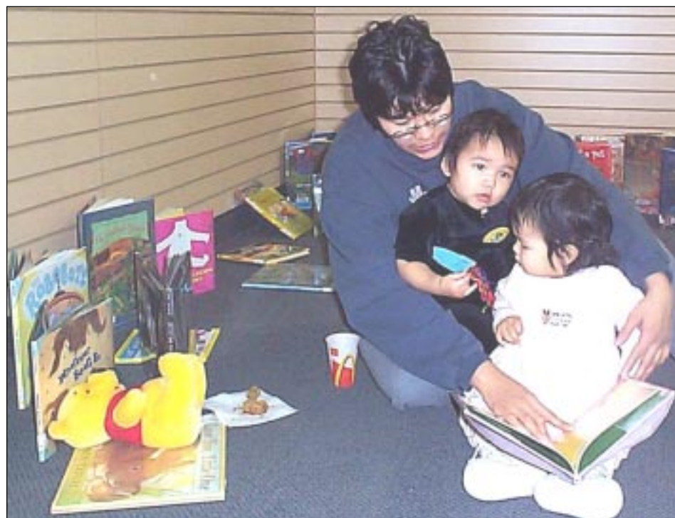
Winnie the Pooh, Mom, and toddlers at Thompson's Teddy Bears' Picnic on Family Literacy Day

Students from Norway House, Cross Lake, Lynn Lake, Thompson and The Pas signed up for this year's Soaring into the Future conference at the Victoria Inn in Flin Flon, featuring workshops on pencil drawing, recycling and diabetes to name just a few. More on the conference next issue.