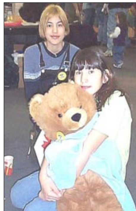
Teddy Bears draw families to read together