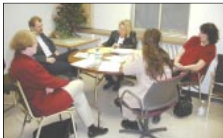
The "Organization" sub-committee at work