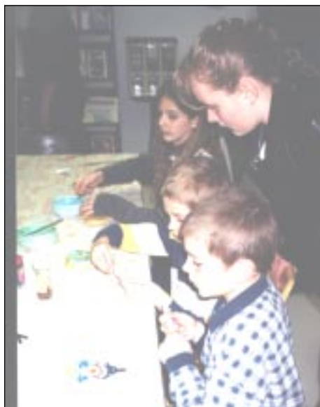
Family Literacy Day at PVLC

The Pembina Valley Learning Centre in Winkler held their annual family day on January 26. The spouses and children of the learners were invited to spend the afternoon at the Centre during regular class time. Family members visited the classrooms and participated in the other activities planned for them. The afternoon ended with parents, children and staff gathering in the coffee room to enjoy the tasty valentine cookies decorated by the kids. Before they left, the children were given “Family Literacy Day” buttons and other treats to add to the candles, valentine cards, and bracelets they had created themselves. Everyone agreed it had been a wonderful afternoon and a great opportunity for family members to learn more about what goes on at the learning centre.