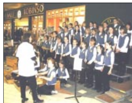
Ecole Robert Browning outside McNally Robinson’s Bookstore at Grant Park Mall

Put your heart into Family Literacy, Everybody read a book, Every week take a book from the library, Everybody read a book.